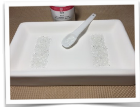
The feet of the Slab Server are filled with coarse frit so the sheet glass melts evenly

6. If the billet does not fit in the mold, cut it into smaller pieces to stack in the mold.