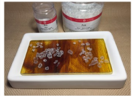
Coarse frit is placed on the top surface to displace the pattern in the sheet glass

Primer™ with a soft artist's brush (not a hake brush) and use a hair dryer to completely dry the coat. Give the mold four to five thin, even coats drying each coat with a hair dryer before applying the next. Make sure to keep the Primo well stirred as it settles quickly. The mold should be totally dry before filling. There is no reason to pre-fire the mold with either primer