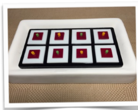
Glass tiles and pieces are stacked to produce playful design. The feet are filled with coarse, black frit