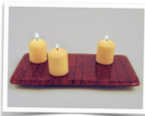
Multiple glass sheets were layered to create a interesting and pleasing design