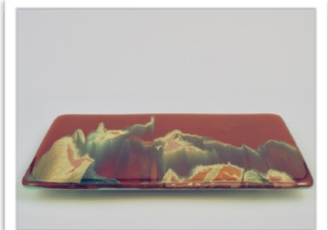
Firing results in a beautiful copper red reaction

To give the final piece a crafted look and to protect table top surfaces, apply Bumpons™ or cabinet door bumpers to the finished piece's feet. Apply two Bumpons™ or bumpers to one foot and a single Bumpon™ or