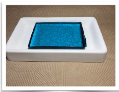
A Bullseye billet piece in the Slab Server design, ready to be fired

Note: Questions about cutting billets can be answered by a wonderful video produced by Bullseye Glass. You can find that video at www.colourdeverre.com/go/billets .