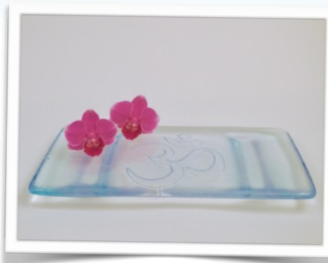
A fiber paper cut-out was placed under the billet piece to create a "kiln carving"