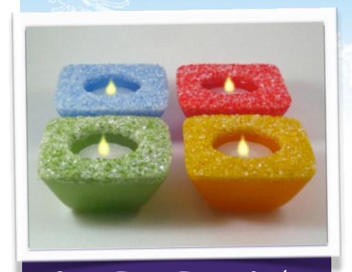
Gem Jop Jea Lights Medium mesh frit is "sugar fired" to the tops of our 3" Square Candle Holders. It is a simple technique with impressive results.