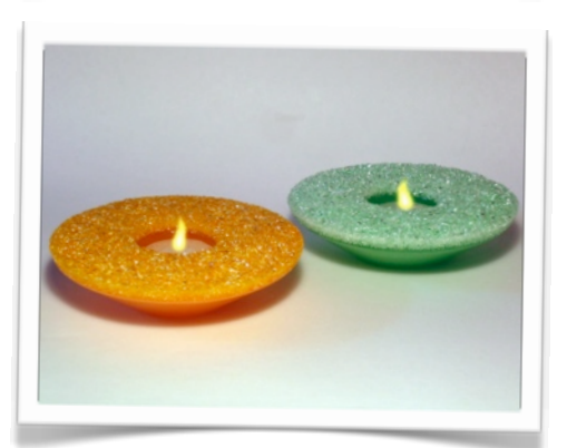
Tack Fuse/Fire Polish Schedule*