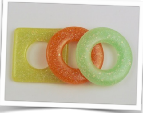
Round and Square Napkin Rings with CBS Dichroic Flakes.

Cane Lay a thin bed of medium Clear frit into each cavity. Stand small segments of vitrograph cane "shoulder-to-shoulder". Top with medium, Clear frit until fill weight is reached. Fire.