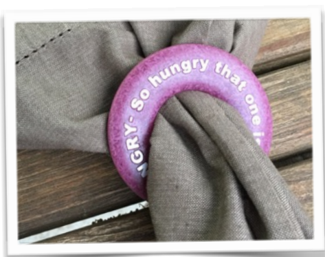
Enamels combined with sandblasting. Artist: Jeri Warhaftig

Reactive Glass Consult glass manufactures' documentation for good reactive combinations. Use medium or course frit.