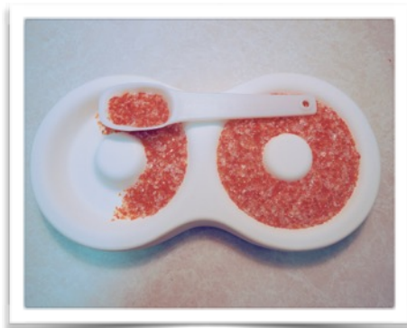
Filling with a mixture of favorite medium frit mixed 50/50 with medium Clear

best results are usually obtained by "diluting" colored frit with clear frit. Even dark, opaque colors like blacks and browns become much more rich when mixed with clear frit. (See our document Creating Frit "Paint Chips") Note: It is important to remember that, when using frit, to wear a dusk mask.