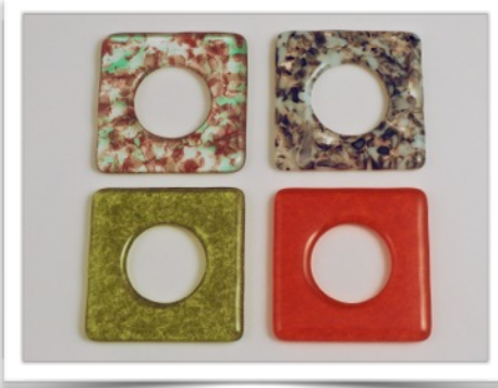
Top-left napkin ring was created with Uroboros Reactive Red Clear and Ming Green

tribute this into the cavity. If necessary, gently use the artists brush to level the Clear frit.