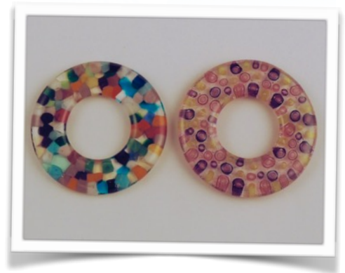
Round Napkin Rings filled with Uroboros Dots and GG Glass cane.

ZYP, visit Colour de Verre website's Learn section. Download and read Advanced Priming with Boron Nitride Aerosol.