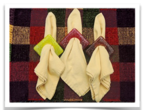
Square Napkin Rings created with dichroic frit technique

Frit Balls Create frit balls (We have a great discussion about these in Serpentine Basics project sheet.) Decorate the napkin rings with frit balls held temporarily in place with small dabs of white glue. Place cast napkin rings back into freshly primed molds. Fire the pieces to 1275°F (690°C) at 300°F (165°C) per hour. Hold for 10 minutes. Anneal at 960°F (515°C) for 30 minutes.