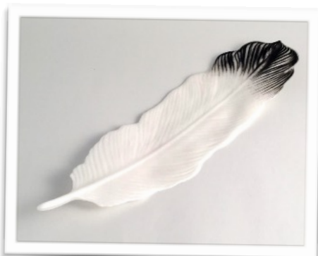
Our Feather design looks elegant in white and black.