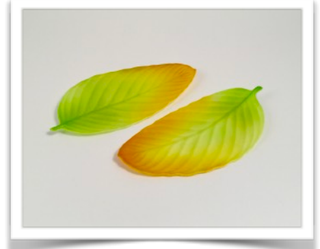
Our Rain Forest Leaf design is a favorite