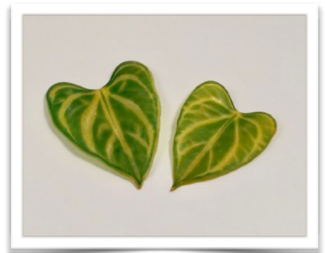
The Tropical Leaves can be done in almost any color combination