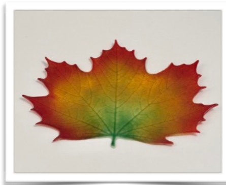
Northwoods Maple in fall colors