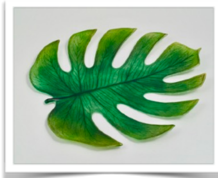
Monstera in kelly green with yellow tips