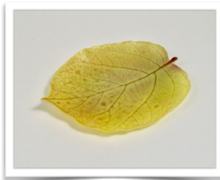
Some people think our Kiwi Leaf looks like an aspen leaf.