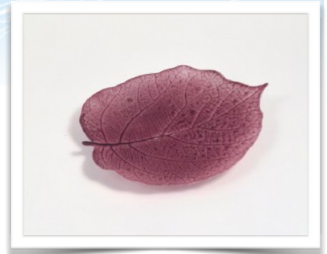
Kiwi Leaf in fuchsia and black

If correctly primed and fired, a Colour de Verre mold will yield many castings.